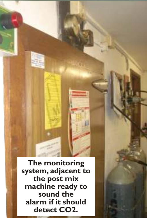
The monitoring system, adjacent to the post mix machine ready to sound the alarm if it should detect CO2.